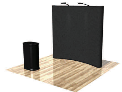
Pop Up Booth Rental -->